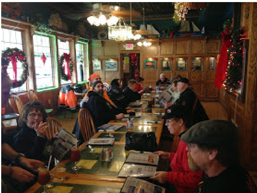
Polar Bear 2015