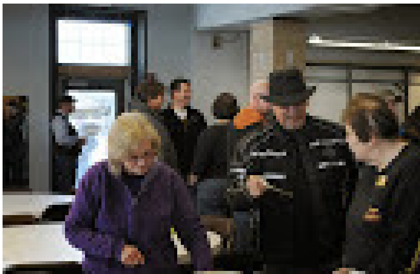
Last Year's Chili Cook Off