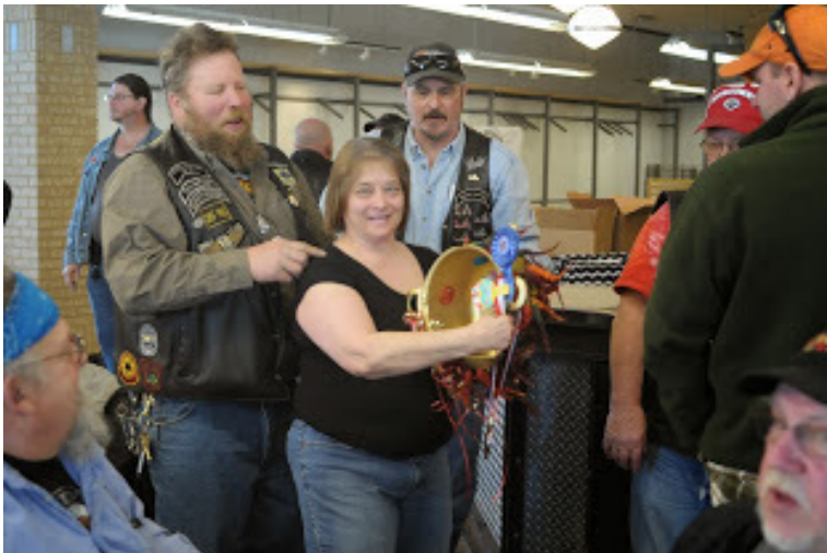
Chili Cook-Off winner!