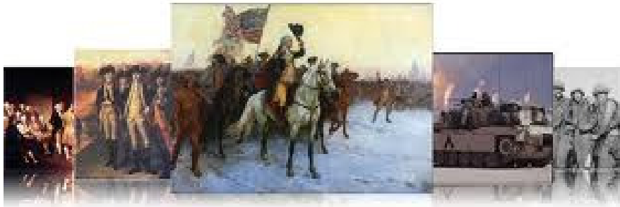
238th Army Birthday