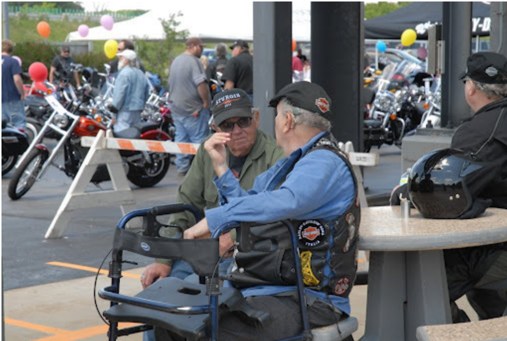
Ukes' Open House June '12