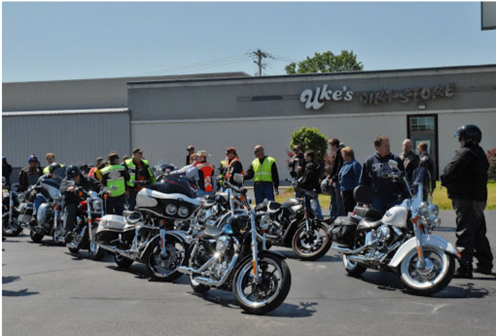
Bikes lined up for test rides at Ukes' Open House '12 with Road Captains leading the ride