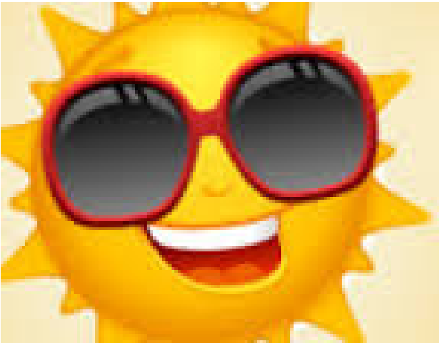
Summer begins ~ LET'S RIDE!