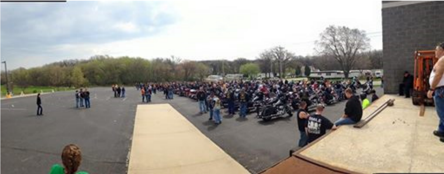
What a Beautiful day for a blessing!