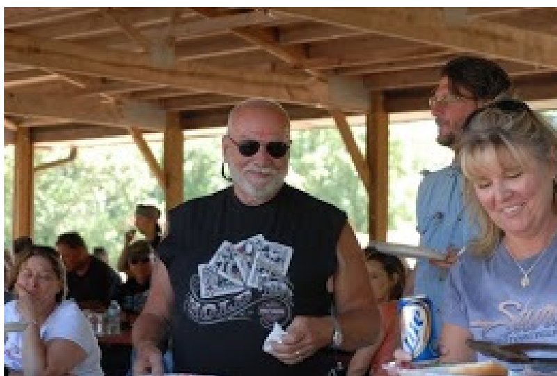
Picnic—see those smiles!!!